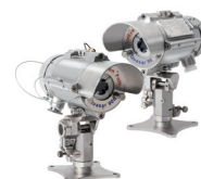
SafEye 900 Series Open Path gas detectors