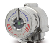
SharpEye 40/40 Series Flame detectors